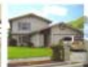
Honolulu is the best option for students wishing to improve their English and live economically in Honolulu.