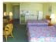
Students can stay in condos and apartments in Waikiki.

IIE Hawaii can take care of all your housing needs, so that your time with us is as pleasant as possible.