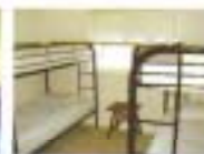
Shared student housing and dormitory rooms.