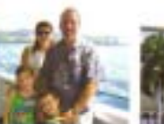
Luxury accommodation available in nearby Wailea.