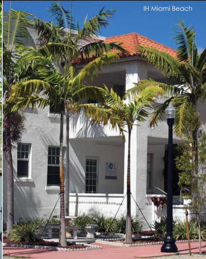
IH Miami Beach